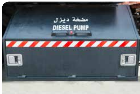
Fuel Pump Compartment