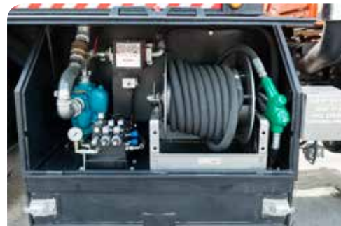
Fuel Pump and Hose Reel