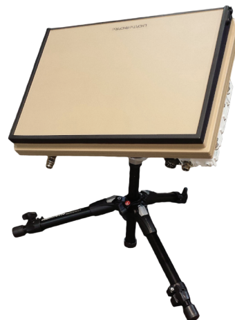
Antenna with Tripod