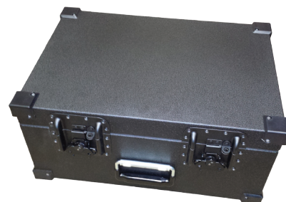
Hard Case (IATA Carry-on Compliant)