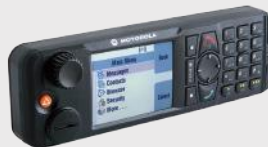
REMOTE CONTROL HEAD