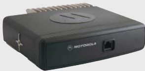
EXPANSION HEAD SINGLE STD CONNECTION