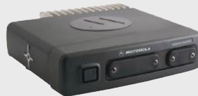
EXPANSION HEAD ENHANCED STD AND AUXILIARY 25 PIN AND RS232