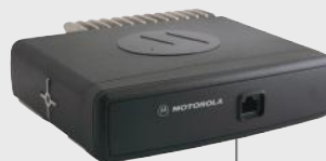
IP67 MOUNT BOAT, MOTORCYCLE