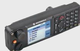
IP67 CONTROL HEAD