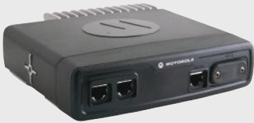
ETHERNET EXPANSION HEAD 2X STD, ETHERNET TYPE, ETHERNET SIM READER AND RS232