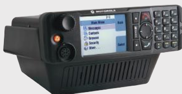
DESK MOUNT CONTROL CENTRE