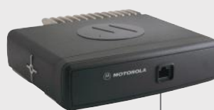
REMOTE HEAD MOUNT CAR, AMBULANCE, FIRE TRUCK