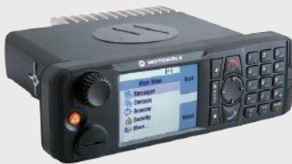
STANDARD CONTROL HEAD