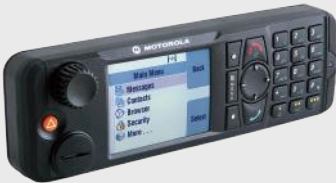
REMOTE ETHERNET CONTROL HEAD (ReCH) SUPPORTS EXTERNAL SPEAKERS AND PTT