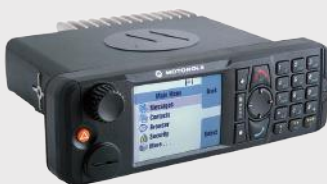
DASH MOUNT CAR, TRUCK